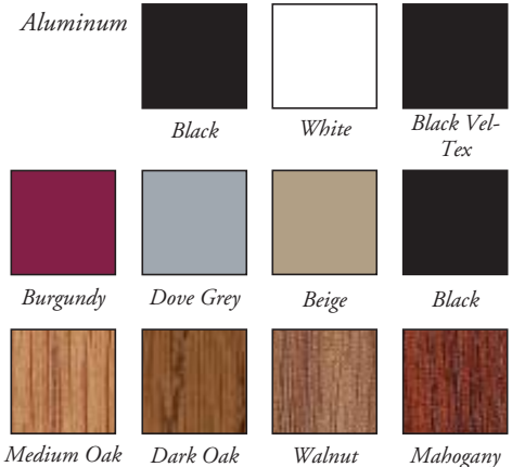
Colors are reproduced as accurately as possible within the limitations of the printing process.

Motorized Tilt: 110-120V., 60 HZ. 3-wire motor behind lower right corner of screen, instantly reversible, lifetime lubricated, with internal thermal overload protector and electric brake. Limit switches accessible with screen tilted. 3-position control switch.