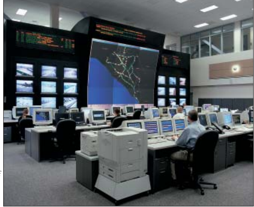
Caltrans, Irvine, CA.—Transportation Management Center. Installed by MCSi. A 3 x 3 MultiScreen System of IRUS screens in Zero Edge frames. Includes custom monitor arrays. System 200 Framing SystemU.S. Patent No. 5,103,339. Zero Edge Framing System U.S. Patent No. 6,000,668.

The IRUS, VORTEX, CINEPLEX and DIAMONDSCREEN may be used in a VIDEOWALL, with individual screen sizes from 30" diagonal through 180" diagonal. DRAPER offers three VIDEOWALL framing systems.