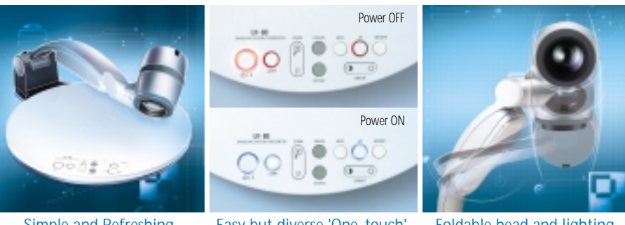
Simple and Refreshing "Round" Shape